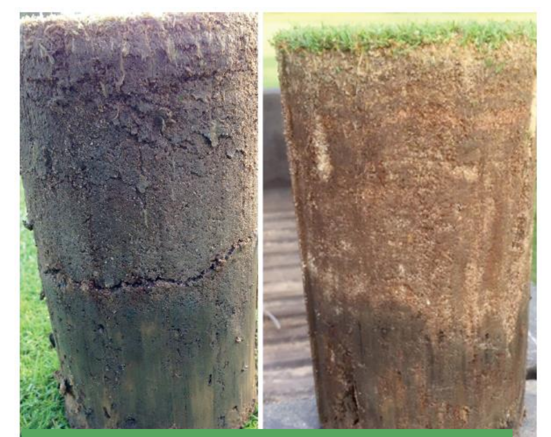
Rootzone before and after 2 years on a Symbio programme using Fish Hydrolysate

Always test mixes before adding to spray tank – Complete a bucket test